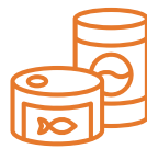
Canned goods (meat, fish, vegetables and fruit)